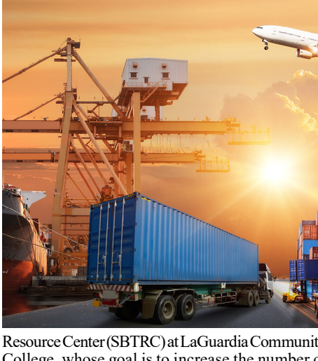
Resource Center (SBTRC) at LaGuardia Community College, whose goal is to increase the number of small businesses that are prepared to compete for and enter into, transportation-related prime and sub-contracts, at the local, state, and federal levels

summer webinar series co-hosted with the United States Small Business Administration (SBA), offering a unique opportunity to engage directly with project stakeholders and resource providers. Learn about ongoing and upcoming Investing in America projects in the New York or Northeast region. Engage in presentations from SBA and USDOT SBTRC on available resources and tools. Participate in a clinic session for feedback on Capability Statements. Maximize your networking opportunities with prime contractors and agencies, including Skanska and MTA. Consider marketing to government opportunities and qualifications. Connect with key resource agencies to navigate procurement and government processes. Benefits for attendees include understanding the Investing in America initiative and Bipartisan Infrastructure Law (BIL) opportunities. You can also learn how to prepare for and identify infrastructure projects, and discover subcontracting opportunities in the Northeast region. On workshop day, you can interact with prime contractors and agencies. The workshop is organized with the major participation of the Small Business Transportation